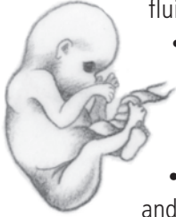
AT THE END OF TWELVE WEEKS

Amniotic fluid around your baby equals about 1 cup. • Your baby swallows amniotic fluid and its tiny kidneys return the fluid back into the amniotic sac.